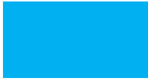
Sky Blue 54"